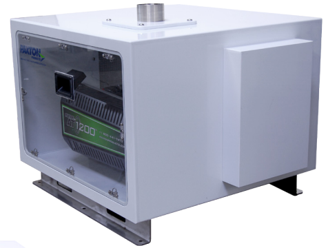
Low Profile Base Enclosures